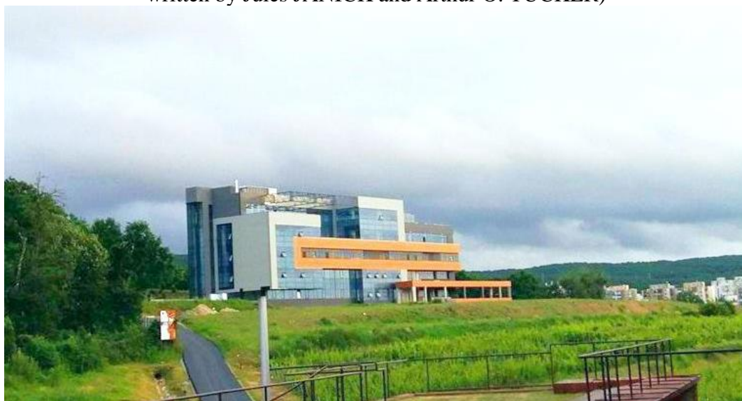
Advanced Horticultural Research Institute of Transylvania ( ICHAT ), opened in October 31, 2016