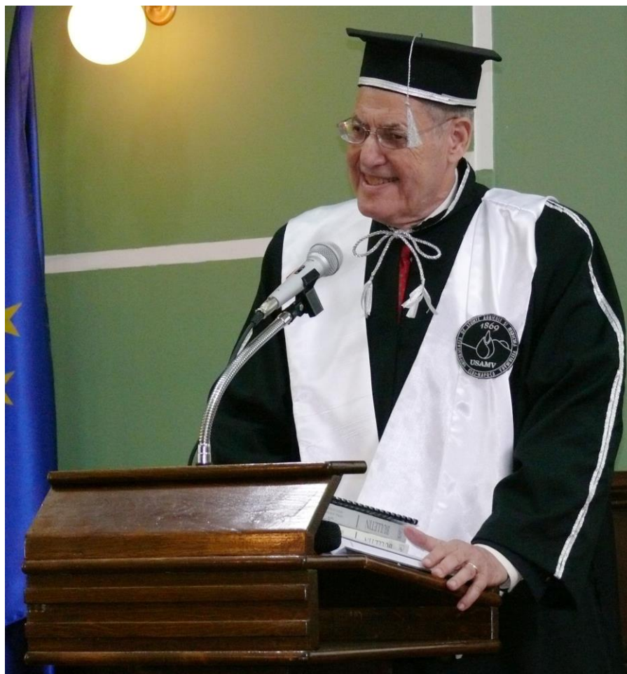
Jules JANICK receiving the highest honorific title of ' Doctor Honoris Causa ', UASVM Cluj-Napoca, September 30, 2010

( http://www.notulaebotanicae.ro/index.php/nbha/article/view/5466/7580 )