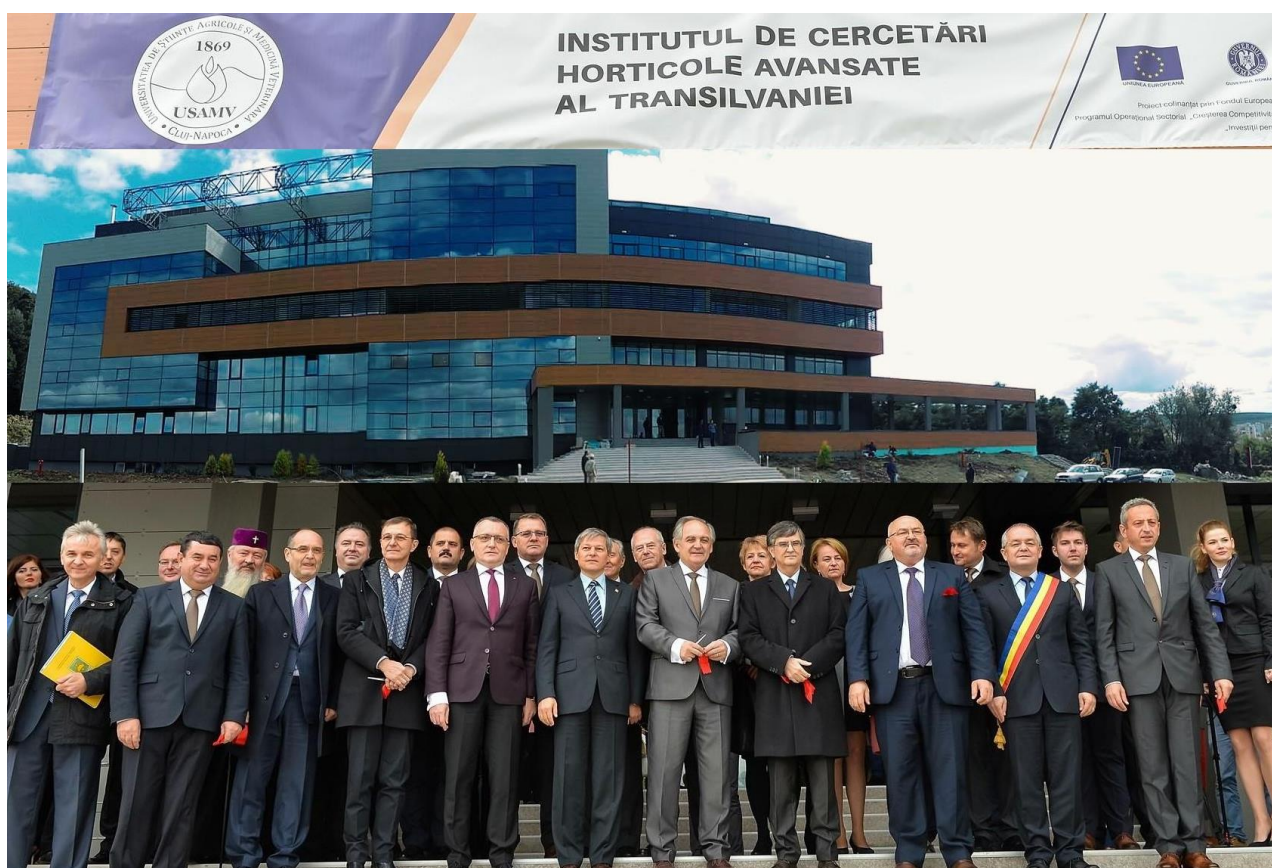
Romanian Prime Minister Dacian CIOLOS (Faculty of Horticulture Cluj-Napoca graduate), officials and academic staff at the opening of the Advanced Horticultural Research Institute of Transylvania (ICHAT), October 31, 2016